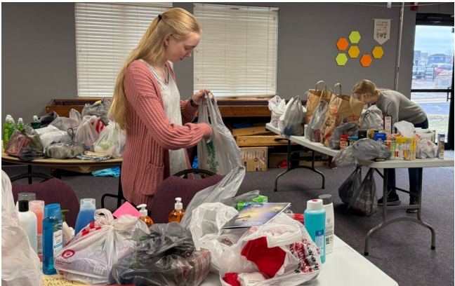
LCR teens sorted your Advent donations. So many thanks to those who donated and those who delivered items to our four organizations.