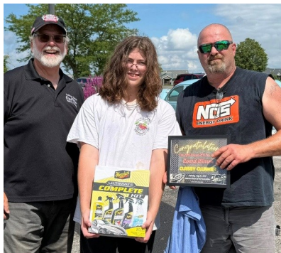
2025 LCR Car Show - Great cars and winners at this year’s event - thanks to all!