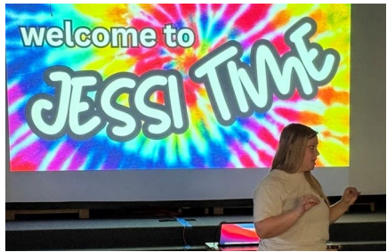
Day Camp was a...