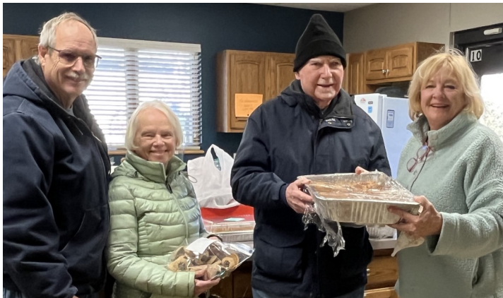
< Some of our wonderful Mission of Hope Lunch Team

The names of friends and family who are dealing with illness will be listed for 2 months.