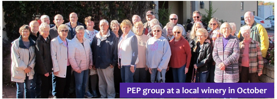
PEP group at a local winery in October