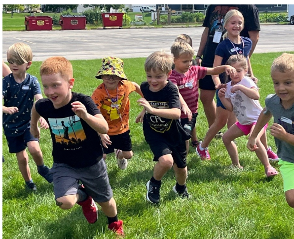
Day Camp was the << best!