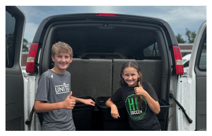
one of our FLY delivery crews!

Thank you to EVERYONE, of every age, who helped feed the kids in our community every single day of Summer 2024! Thank you for your monetary donations also.