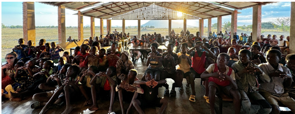
Camp Chisomo | Malawi, Africa | A place for kids to be kids.