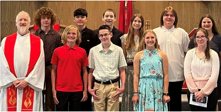
^ Our 2024 Confirmands ^