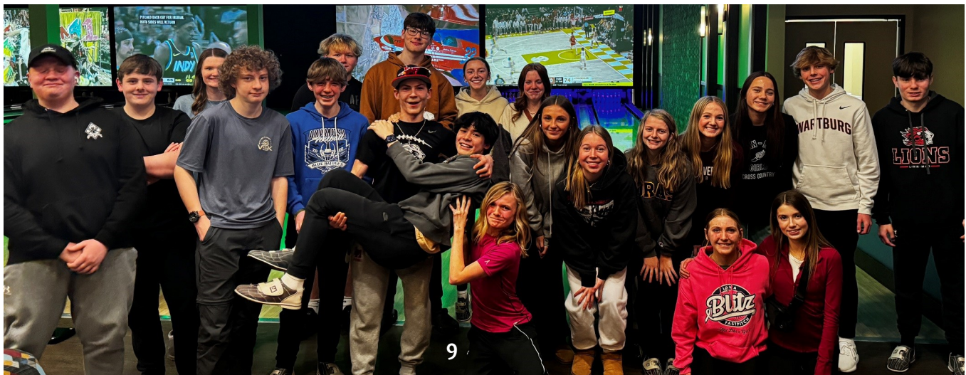
EDGE+ students bowling @ Spare Time