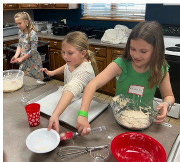
First Communion students baked bread!