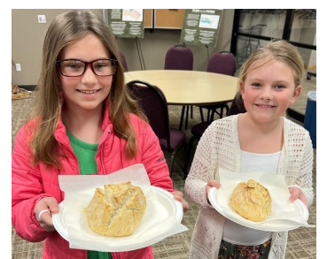
First Communion students baked bread!