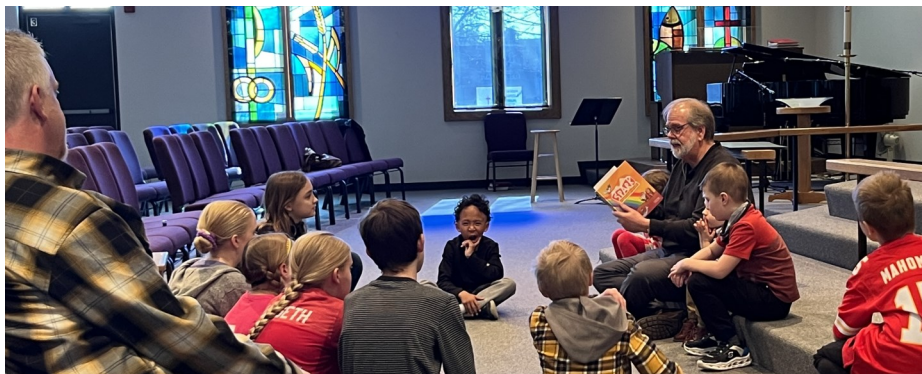
Sunday Children's Message

Text Notifications - Worship services and other events are subject to change with circumstances. If you would like text notifications of schedule changes / cancellations, call the church office (319.377.4689) and give us your name & cell number ~OR~ you can sign yourself up at https://share.hsforms.com/181uDRkYnTRyGMmuwl3ZiDQ44ay4