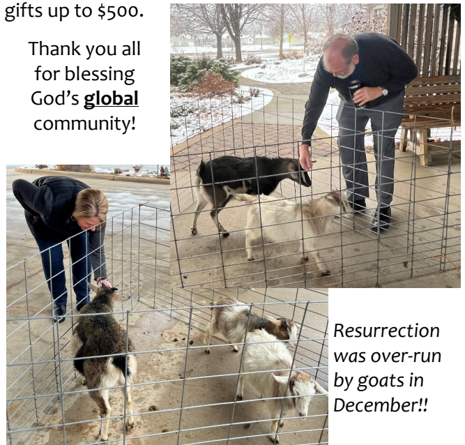
Resurrection was over-run by goats in December!!

Thank you all for blessing God's global community!