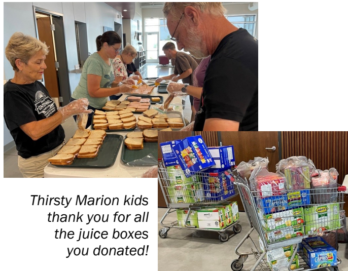
Thirsty Marion kids thank you for all the juice boxes you donated!

One more big "THANK YOU" for being part of the Summer 2023 F.L.Y. program, which ended on 8/18. Thank you to the many, many, many people who donated their time and resources to feed literally hundreds of local kids every single weekday this summer. We are so grateful for how you share God's love.