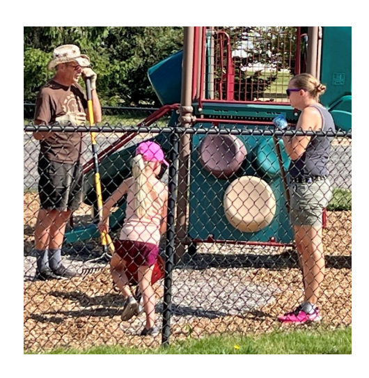
Wee Wisdom friends mulch the playground