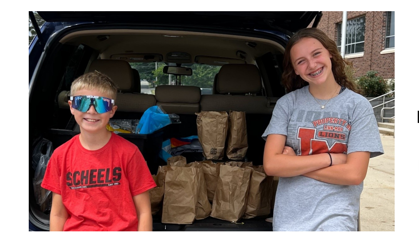
EDGE students have been delivering FLY meals