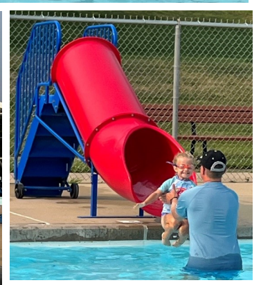
So much creativity at Resurrection!