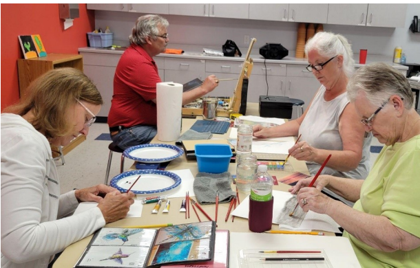
LCR Painting Group