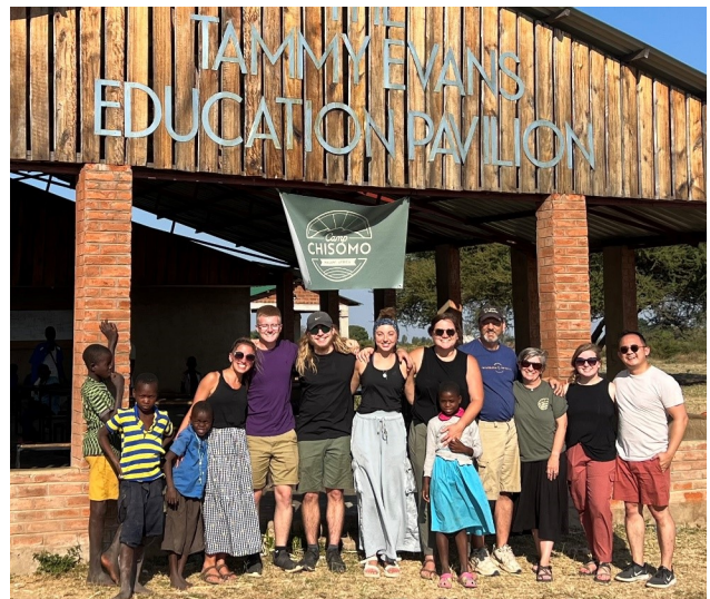
Several Resurrection folks checked in at Camp Chisomo in Malawi last month.

If you would like to send a card to anyone listed above, feel free to contact the church office for current addresses.