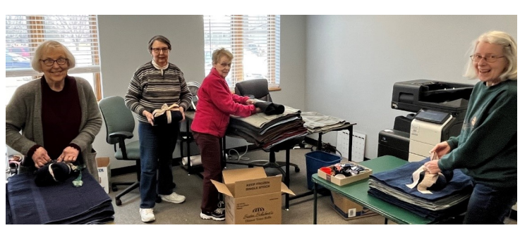
Rebecca Mary Martha Circle women assembled even more Personal Care Kits! Awesome work, ladies.