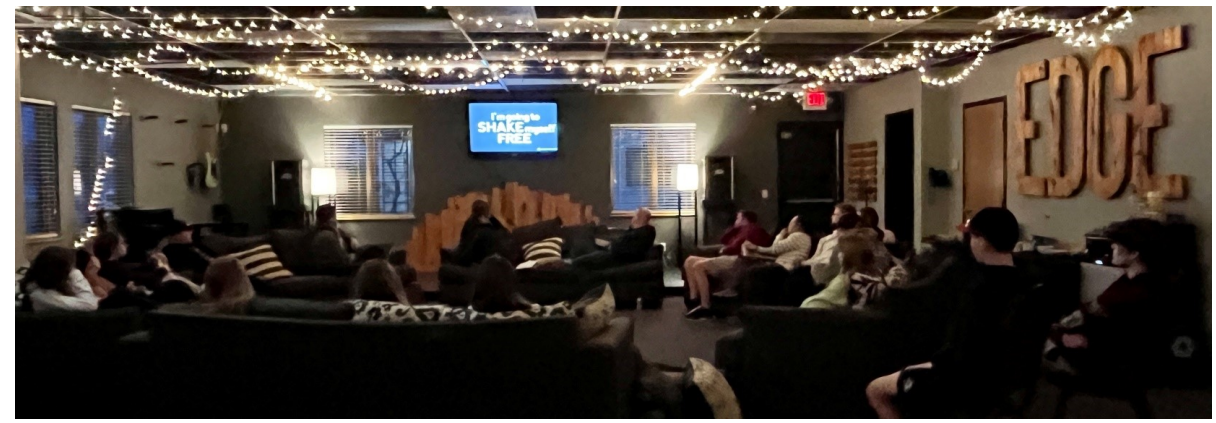
8th graders discipled with the EDGE students during Lent