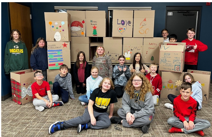
Wednesday Night Live kids decorated boxes for our Reverse Advent project. Nice work, crew!