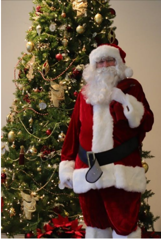
Santa came to Lifetree Cafe!

NON-PROFIT ORG. U.S. POSTAGE PAID Marion, Iowa Permit #11