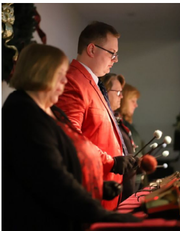
Christmas Concert & Reception - Dec. 8th Beautiful!

Resurrection Lutheran is currently hiring two part-time nursery attendants for Sunday mornings from 7:45 to 11:45 am. We are looking for responsible, caring, and faithful people to serve with our precious little ones, infant through age 5. These are paid positions - $18.75 per hour. Applicants must be 21 or older. Job descriptions and applications are available on the entryway bulletin board; please return to Evelyn Beck in the church office.