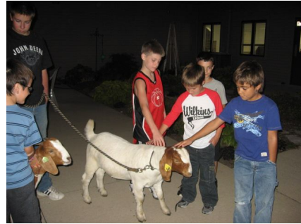
Our Goat Visitors

Special dates: 11/10 Movie Night 11/24 No WNL - Thanksgiving Break