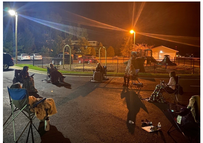
EDGE small groups met outside as long as they could!

Follow EDGE on Instagram - https://www.instagram.com/edgeatlcr/