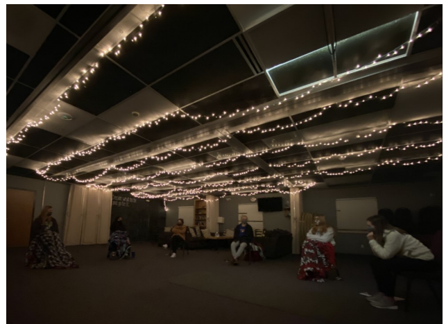
EDGE Youth finally come indoors for the fall.