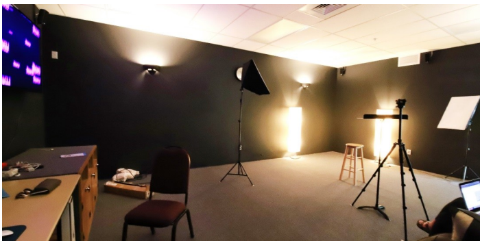
Resurrection's new media room

In September, the LCR council approved formation of a new team for dealing with church building and property maintenance and upgrade issues. The team is made up of two council members, the office manager, and a few congregation members. One of the first issues they have assessed is our electricity usage. After receiving results from a walk-through with a Linn County REC commercial energy advisor, the team decided to begin a needed upgrade this fall of 1/3 of our fluorescent light fixtures. Approximately 75 fixtures will be converted to use more efficient LED tubes. Each 4-tube LED fixture will draw less than half the power than the current fluorescent tube fixture. A rebate will help offset the conversion cost in 2020. The remaining fixtures will be converted to LED tubes in 2021.