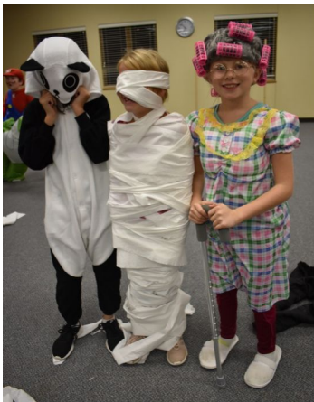
We had lots of fun at our Fall Party in October.

3rd—5th Grade Students Wednesdays 6:00—7:00 pm Fellowship Hall