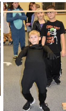
Limbo now! How low can you go?!